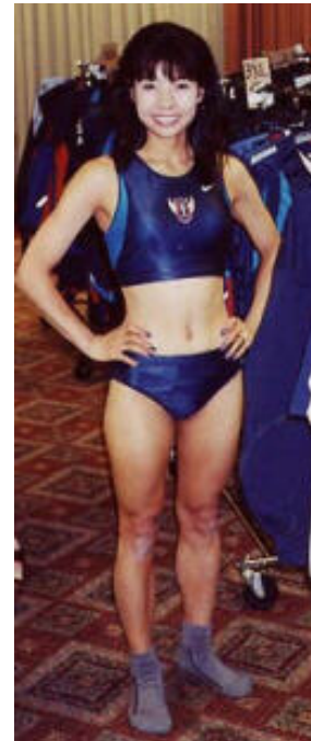
Chen tries on her US Olympic Team uniform, July 2000

Chen emigrated to the US in 1993 after becoming the first Chinese female track athlete to win an Olympic gold medal - in the 10,000 meter walk in Barcelona. She retired from racewalking while getting the education she sought. She received her US citizenship on April 12, 2000.